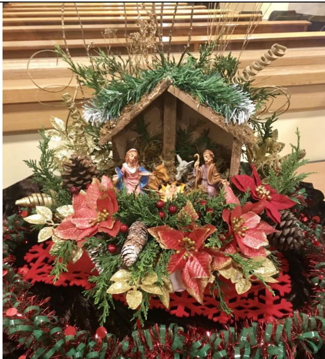
The cribs at St Joseph's Church

As we returned to school on the feast of the Epiphany which celebrates the arrival of the Wise Men, some families shared pictures of cribs. The Christmas season officially came to a close on Sunday, with the feast of the Baptism of our Lord, but some keep their crib up until Candlemas, the feast of the Presentation, on February 2 nd , like the one in St Peter's Square!