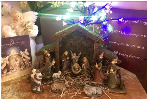
The Orlina family's crib