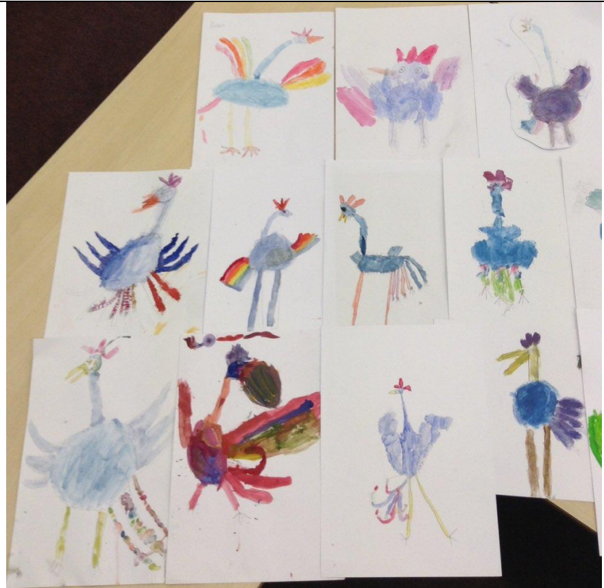
Watercolour Roly Poly Birds from Roald Dahl's "The Twits". The original illustrator, Quentin Blake, liked these so much he commented on the Year 3 tweet.